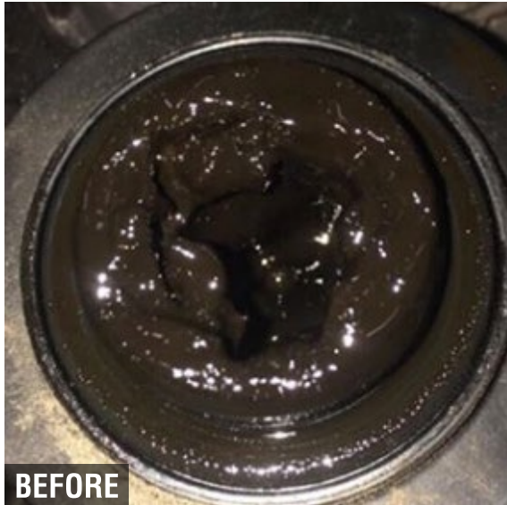
OIL FILL PORT